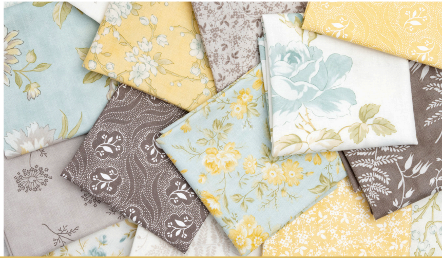
DLL 208 Turn on the Charm Quilt 62" x 62" PP Friendly by Designs by Lavender Lime Pattern also includes 48" x 48" Topper