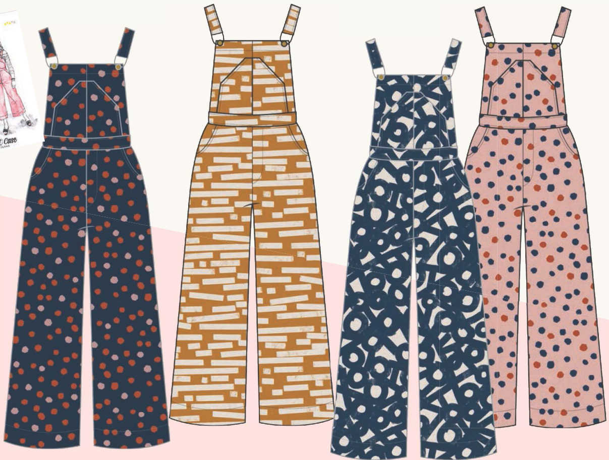
CC 14 Closet Case Files - Jenny Overalls