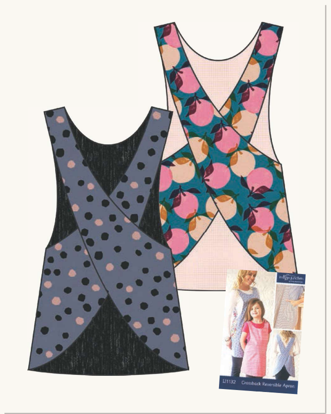
IJ 1132 Indigo Junction - Crossback Reversible Apron