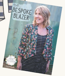
STG 8798 Sew to Grow - Bespoke Blazer