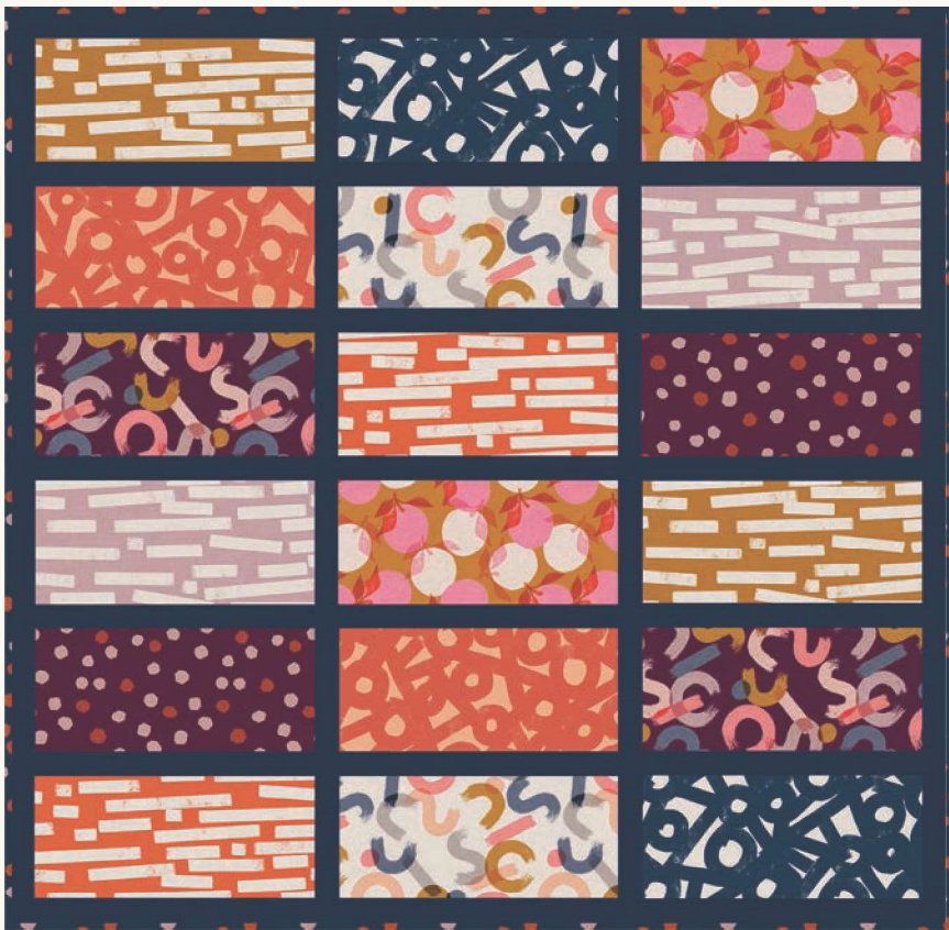
PS RS5022-1 Ruby Star Society - Roll Up Picnic Quilt Project Sheet 60" x 58"