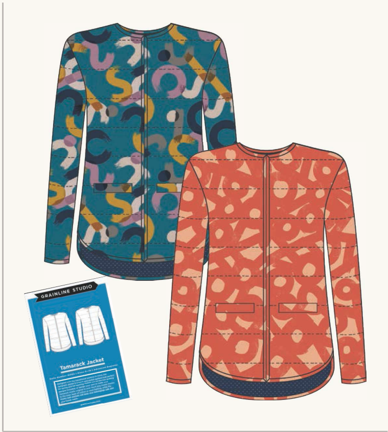
GS 16002 Grainline Studio - Tamarack Jacket