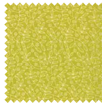
№ 10008 14 Leaf