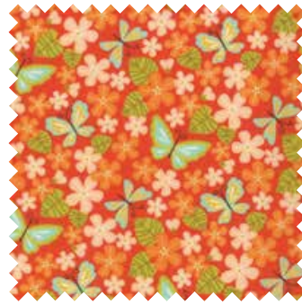
№ 10004 15 Tangerine