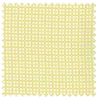
№ 10007 11 Leaf