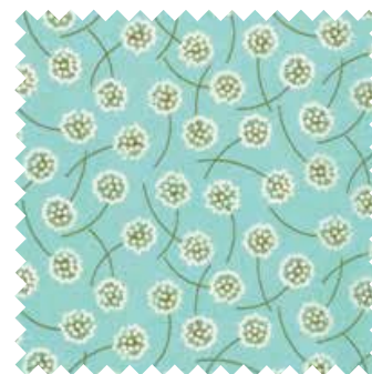
No. 10002 15 Robins Egg