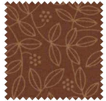
№ 10008 19 Chestnut