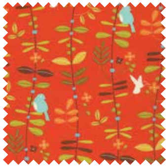
№ 10003 13 Tangerine