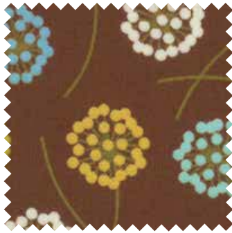
№ 10002 19 Chestnut