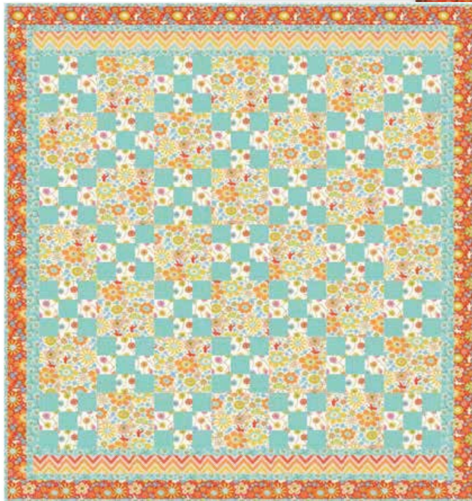
1 CHD 1307 CHD 1307G Garden Party Size: 78"x90"