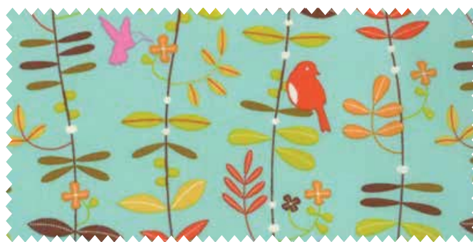
No. 10003 12 Robins Egg

Since Wrens & Friends is my first collection, I'm really excited to see what the quilters out there do with it. When I saw the first samples as they came to my house I was inspired to try my hand at designing my first quilt block. It's based on the clover motif used in some of the fabrics. Of course I had to try sewing curves for my first ever block! It's not the neatest effort, but I think once I've made a few I'll get the hang of it...or else I may have to turn to applique! This project will be the moda project sheet available on the free patterns section of www.modafabrics.com