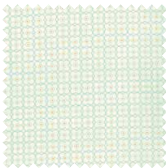
No. 10007 13 Robins Egg

I designed Wrens & Friends last year for an art trade show called Surtex. It started out with a very different look with lots of texture & muted colors. It seemed somber to me that way so at the very last minute I reworked it & I am so glad I did. It's a much happier collection now & is really more me. I would say that the inspiration for it came from my mom & my grandmother. They inspire lots of what I do, but I didn't seem to get their green thumbs when the genes were working their magic. They happily spend hours in their gardens digging, planning, planting and bird watching. They wouldn't agree, but I think gardening is their art. I try, but I seem to kill every plant my grandmother gives me!