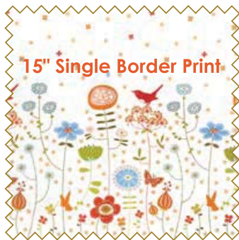
№ 10000 11 Cream