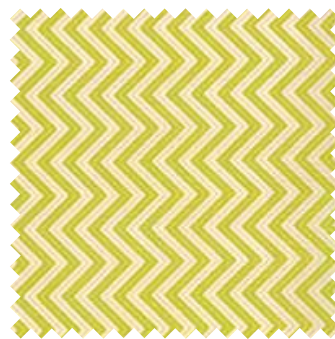
№ 10005 11 Leaf