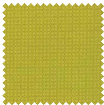
№ 10007 18 Leaf