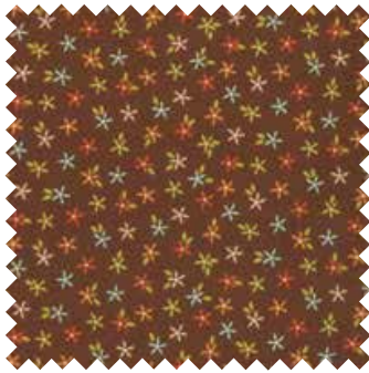
№ 10006 18 Chestnut