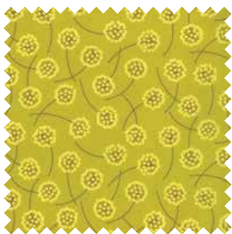
№ 10002 13 Leaf