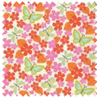
№ 10004 12 Tangerine