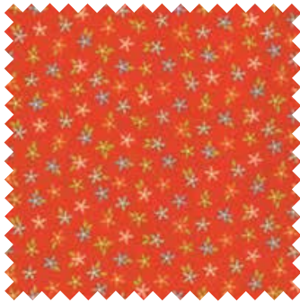
№ 10006 16 Tangerine