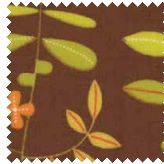
№ 10003 14 Chestnut