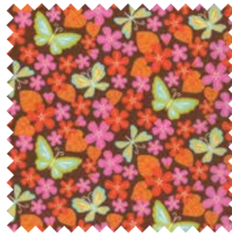
№ 10004 17 Chestnut