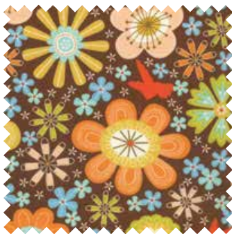
№ 10001 13 Chestnut