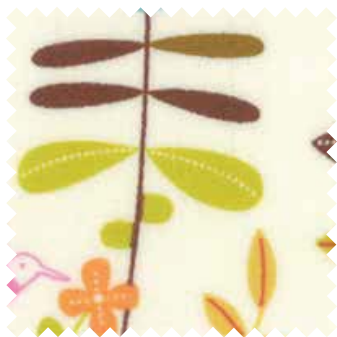
№ 10003 11 Cream