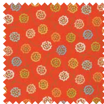
No. 10002 18 Tangerine