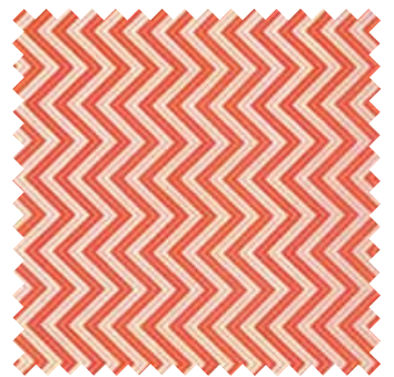
№ 10005 17 Tangerine