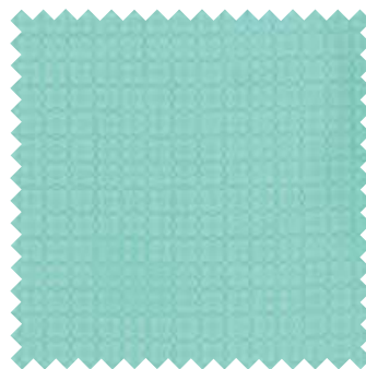
No. 10007 20 Robins Egg