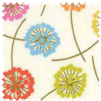
№ 10002 11 Cream