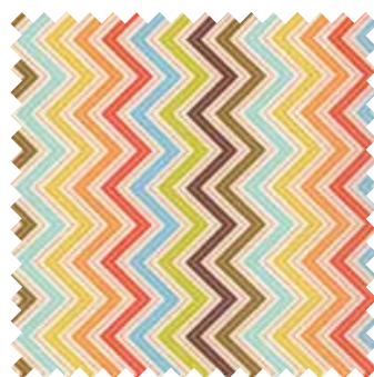
№ 10005 19 Multi Cream