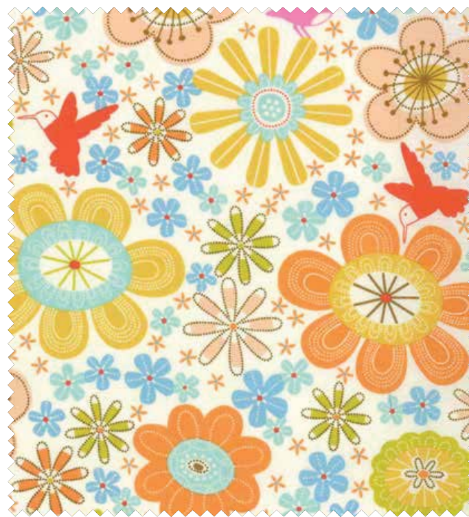
№ 10001 11 Cream