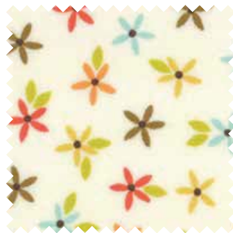
№ 10006 11 Cream