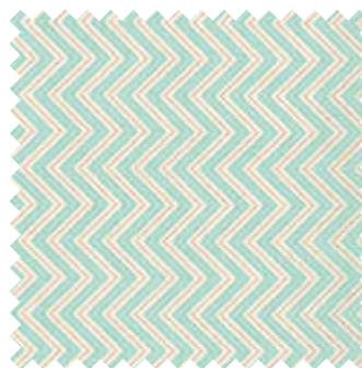
No. 10005 13 Robins Egg

As for my process, a collection is roughly designed in my imagination before I ever start drawing. I used to feel guilty about this because all the action was taking place in my head and it wasn't apparent that I was "working." Not always a good thing when you have a corporate job! I love a good daydream...I get my best ideas driving or doing mundane things like housework! I take those ideas I see in my head and do rough sketches on a tracing pad or even on 3x5 cards. I pull magazine or internet images that inspire the collection too and pin those on foam core panels where I can see them as I design. I then might scan in my drawings so I can trace them or just start drawing directly on the computer. I love the flexibility that comes with designing digitally. I remember what it was like to design when the best technology we had was a Xerox machine. I love that I can try drawing and layout options quickly and all without layers of tracing paper and pencils and erasers. I design everything in black and white and grays first then add color when the shapes and layouts are right.