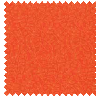
№ 10008 18 Tangerine