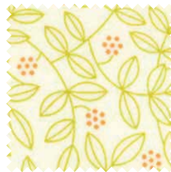
№ 10008 11 Cream