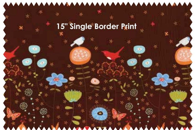
№ 10000 13 Chestnut