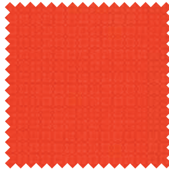
№ 10007 24 Tangerine