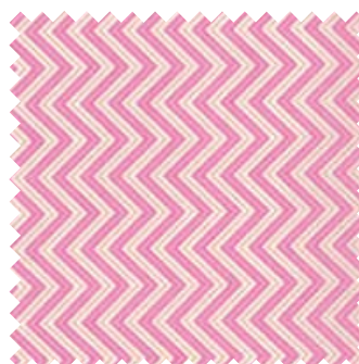
No. 10005 16 Peony