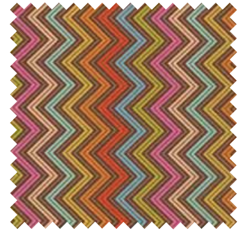
№ 10005 21 Multi Chestnut