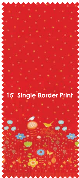
15" Single Border Print