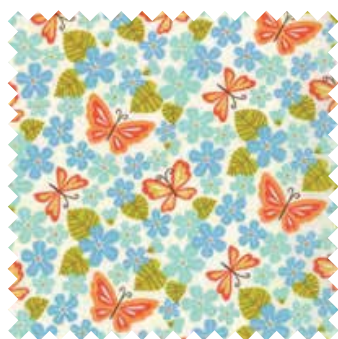
№ 10004 11 Robins Egg