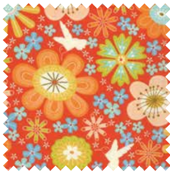
No. 10001 12 Tangerine