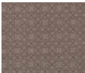
13096 15 Grey