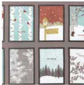
13090 14 Grey