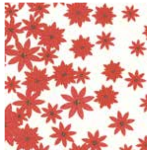
*13091 16 Snow