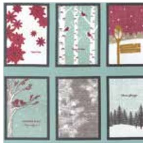
13090 13 Mint