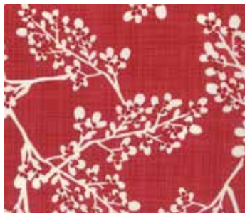
*13093 13 Berry