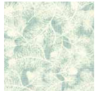
*13094 19 Mint