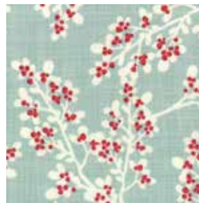
13093 14 Mint