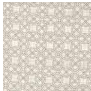
*13096 12 Snow