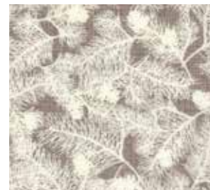
*13094 17 Grey

Fabrics with * included in low cal assortment