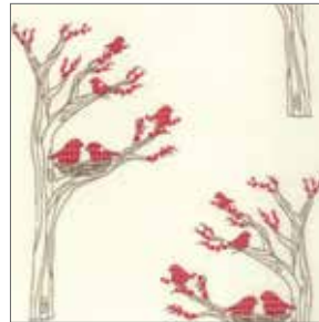
13092 16 Snow