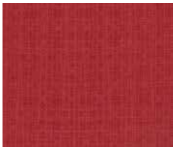
*13096 13 Berry