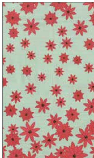
*13091 14 Mint