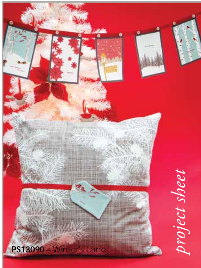
PS13090 – Winter's Lane