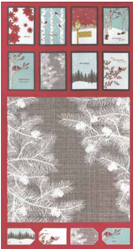
13090 12 Berry

Bella Solids are not included in Precuts or Assortments.