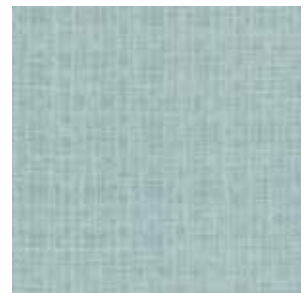
*13096 14 Mint