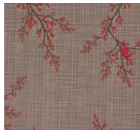
*13095 15 Grey