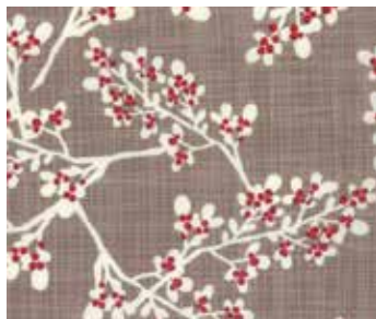
*13093 15 Grey