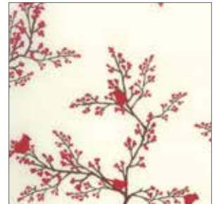
13095 16 Snow