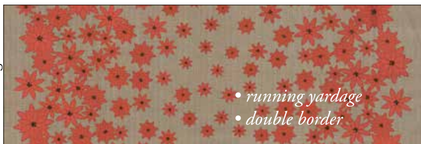
13091 15 Grey