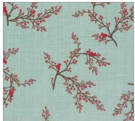
13095 14 Mint