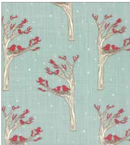
*13092 14 Mint