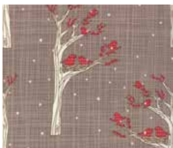
13092 15 Grey